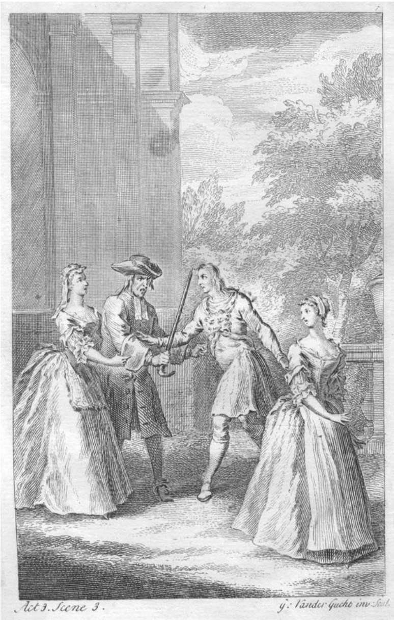
Act 3. Scene 3.