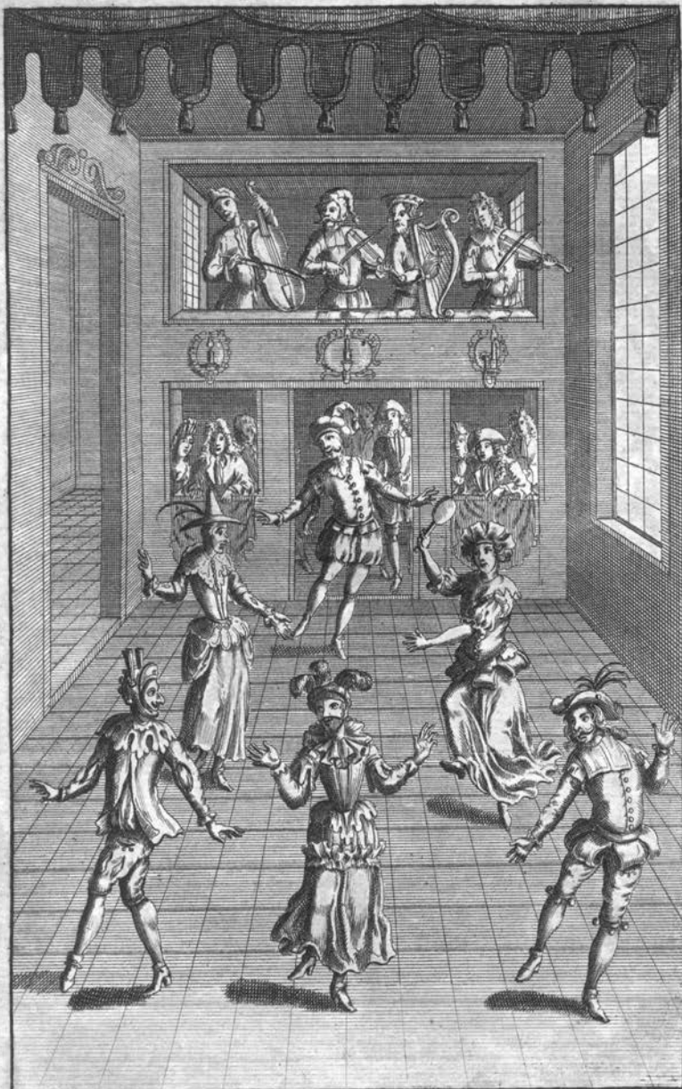
Wit at severall Weapons Vol. 6. p. 3360